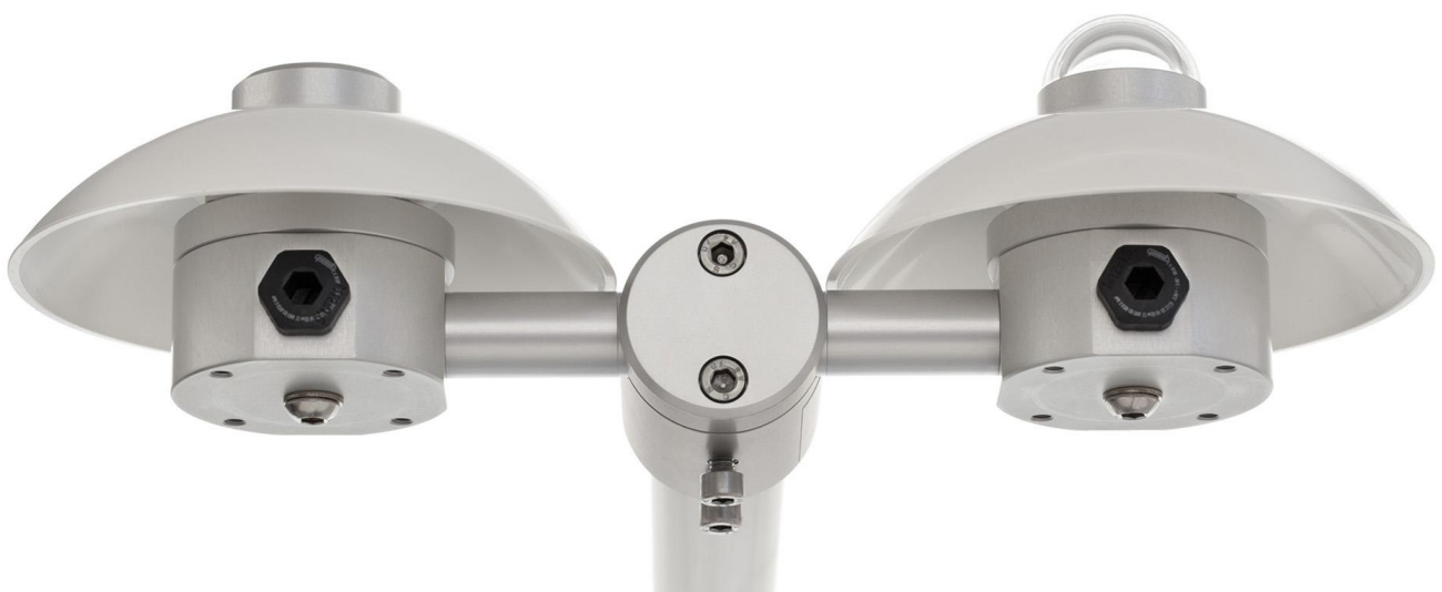
Figure 1 RA01 2-component radiometer

RA01 is a market leading 2-component radiometer, mostly used in scientific-grade energy balance and surface flux studies. It offers 2 separate measurements of solar and longwave radiation. Product features include a modular design, low weight, and easy levelling, and low solar offsets in the longwave measurement. The unique capability to heat the pyrgeometer reduces measurement errors caused by dew deposition. When combined with estimates of solar albedo and of local surface temperature, this instrument can also be used for estimation of net radiation. The advantages of this approach are cost reduction and independence from local surface properties.