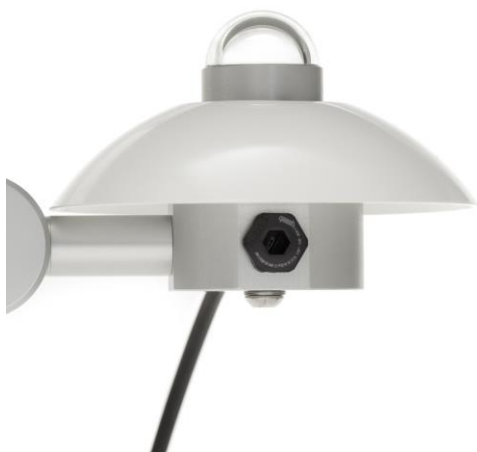
Figure 4 RA01 2-component radiometer in detail: pyranometer model SR01

Applicable instrument-classification standards are ISO 9060 and WMO-No.-8; Guide to Meteorological Instruments and Methods of Observation.