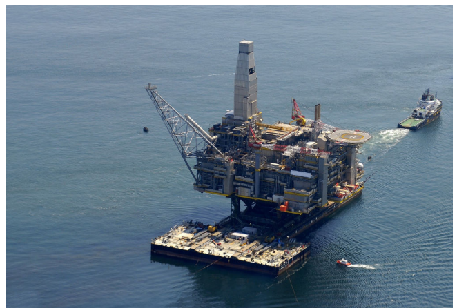
In addition to meteorological observation networks, PWD50 is also well-suited for use in offshore operations.

Published by Vaisala | B211069EN-C © Vaisala 2018