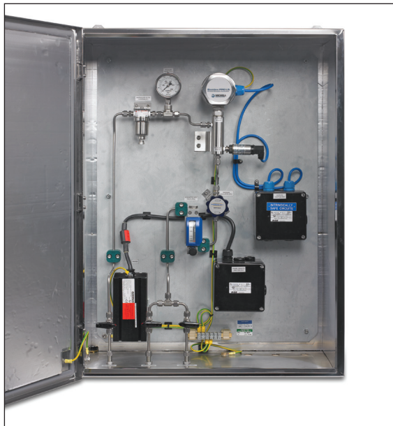
Promet I.S Sampling system

A minimalist approach to the sampling system design is essential to ensure best dynamic response to process moisture variations. A particulate filter and isolation valve are the only components prior to the sensor.