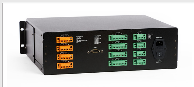
Rear panel input/output connections

The Control Unit in the multi-channel format can also include a moisture in liquid analysis or oxygen measurement function by combining with the Liquidew I.S. Moisture in Liquid Analyzer or the Minox-i O 2 transmitter.*