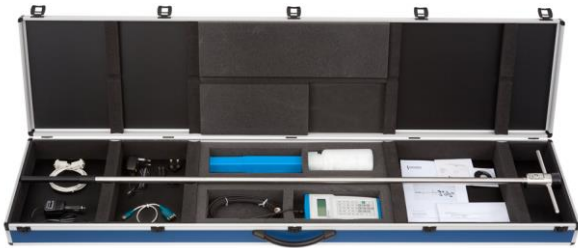
Figure 5 The complete FTN02 system: FTN02 includes one spare sensor TP09, adapters for charging the system in the office, WSA02, and in an automobile, CA02. Also included are communication software and a jar for glycerol. Glycerol must be purchased locally.