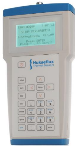
Figure 4 FTN02: CRU02 control and read out unit