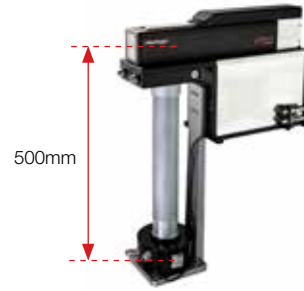
BeamWatch Integrated with 500mm distance between focus position and power meter