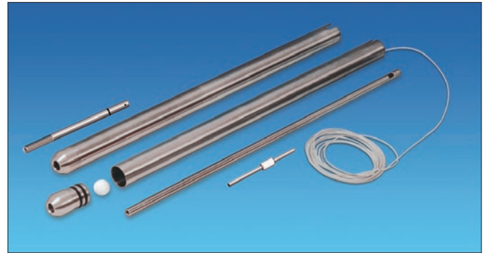
Point Source Bailers come in standard lengths of 2 ft. (610 mm), 3 ft. (910 mm), or 4 ft. (1220 mm)

The miniature 0.5" (12.7 mm) diameter model is ideal for use in narrow tubes and direct push devices.