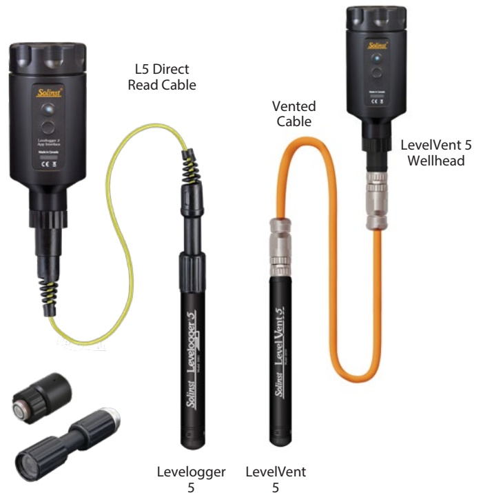
L5 Threaded and Slip Fit Adaptors allow you to directly connect your Levellogger to the Levellogger 5 App Interface.